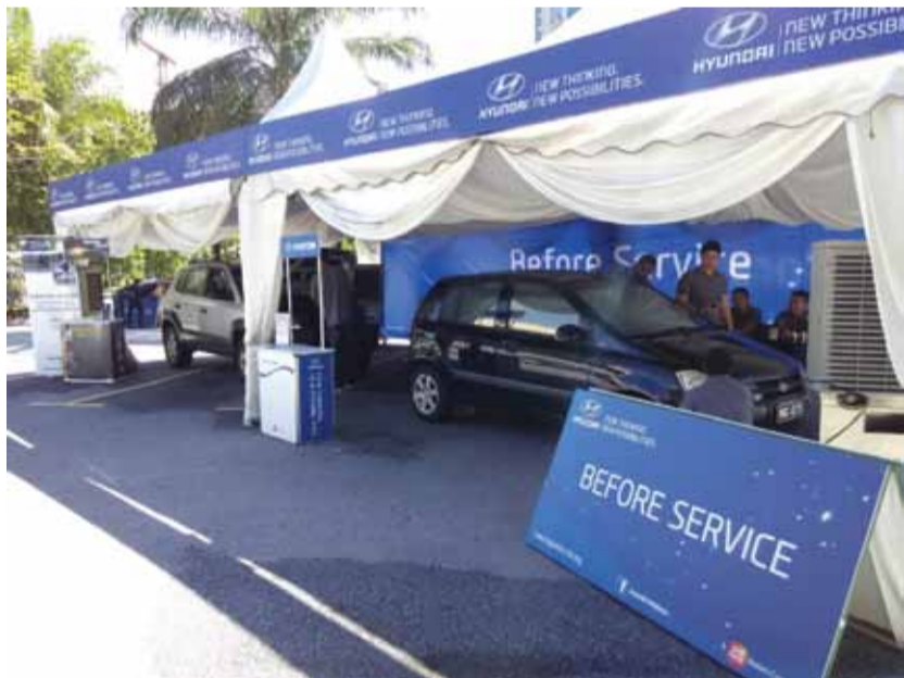
Before Service 20 Point Inspection Booth