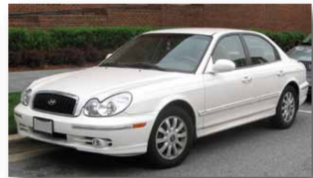
GEN. 4 /1998

Greatly enhanced safety and convenience features.