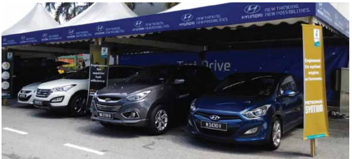
Hyundai cars offered for test drive