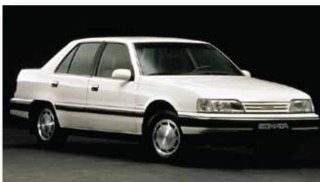
GEN. 2 /1988

Where it all began – used to be the most premium vehicle in Hyundai Motor Company's line up at the time.