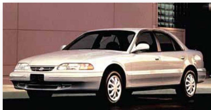
GEN. 3 /1993

Attempt at curvy designs, the trend at the time.