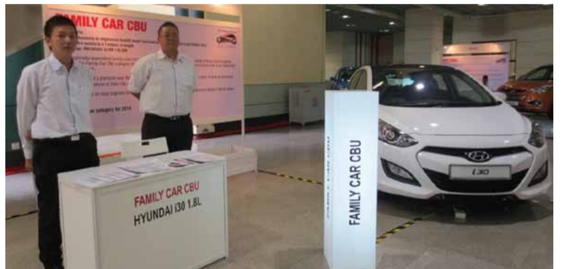
Hyundai i30 - nominated for Best Family Car CBU