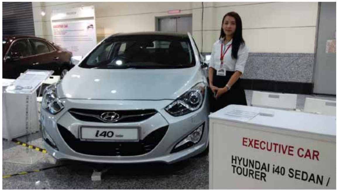
Hyundai i40 - nominated for Best Executive Car

Hats off to our after sales team for all your hard work.