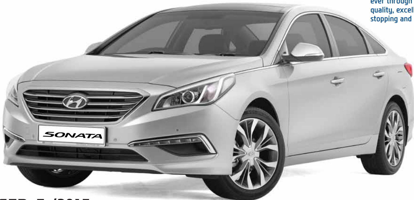
GEN. 7 /2015

The Sonata LF – the best Sonata made ever through enhancement in basic quality, excellence in driving, braking, stopping and protecting.