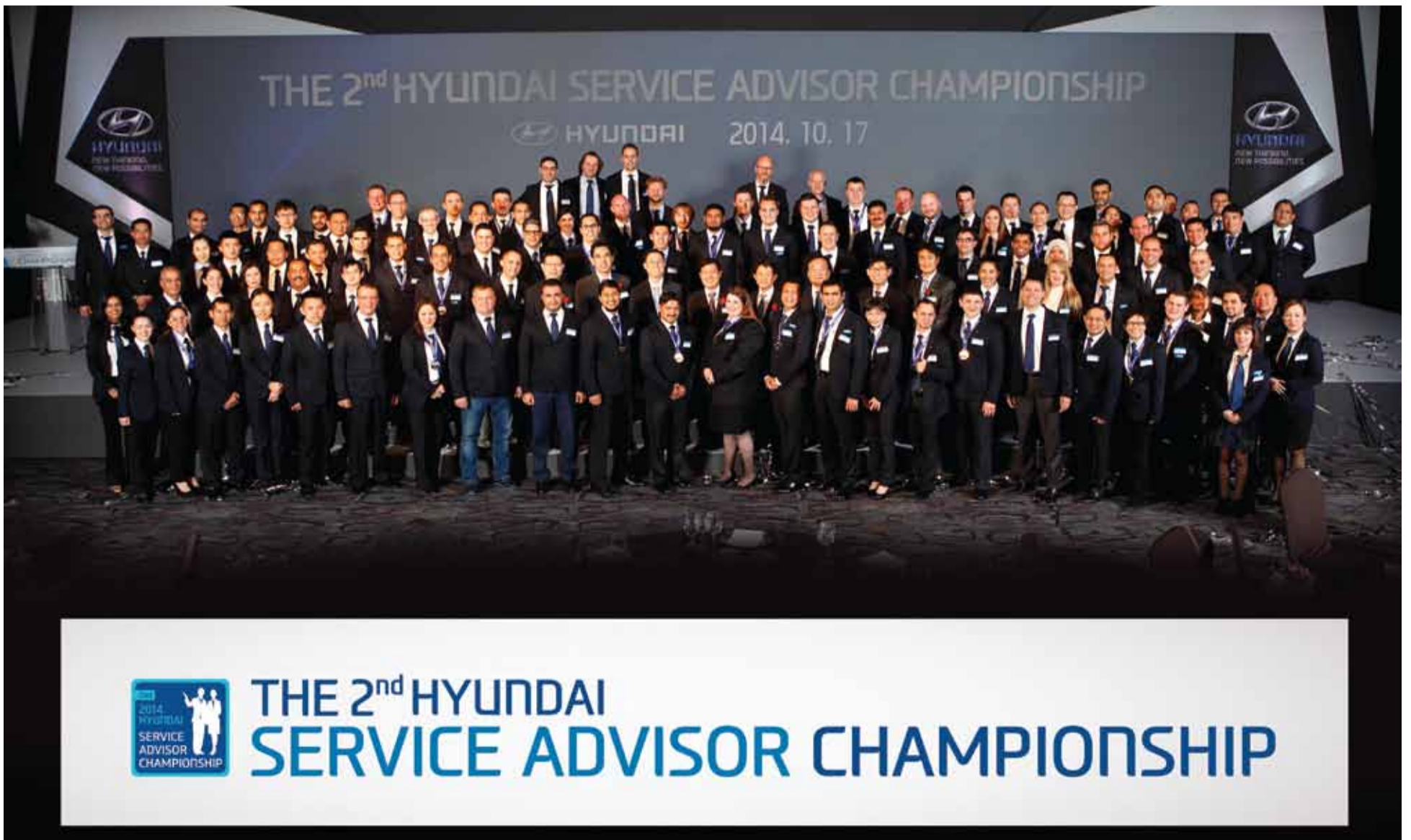
Group photo of the global attendees at the Championship