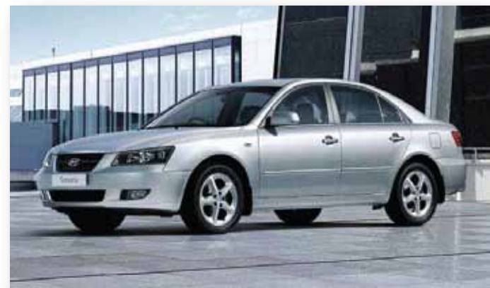
GEN. 5 /2004

Greatly enhanced R & H for a smoother ride.