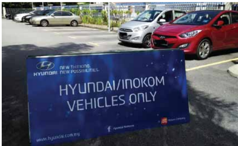
Privileged parking for Hyundai car owners