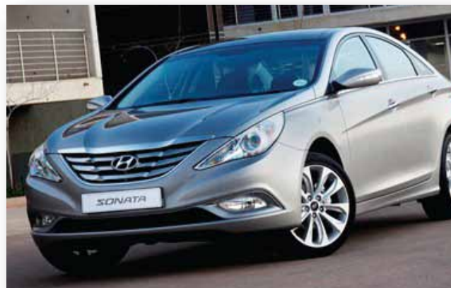
GEN. 6 /2009

Equipped with the newly developed Theta engine.