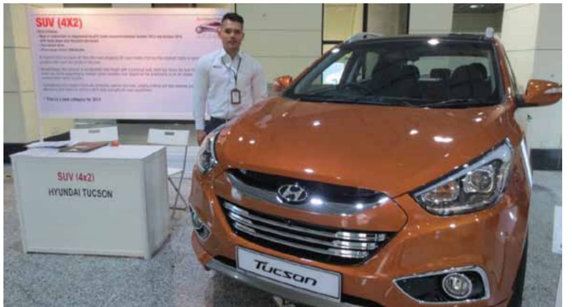
Hyundai Tucson - nominated for Best SUV (4 x 2)