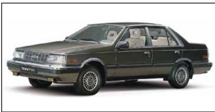
GEN. 1 /1985

Where it all began – used to be the most premium vehicle in Hyundai Motor Company's line up at the time.