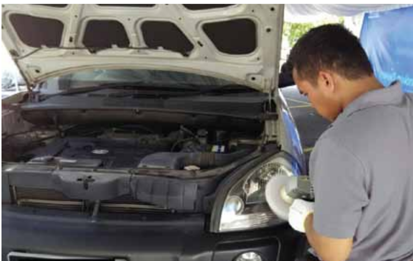
Free headlamp polishing for car owners