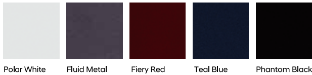
Polar White Fluid Metal Fiery Red Teal Blue Phantom Black