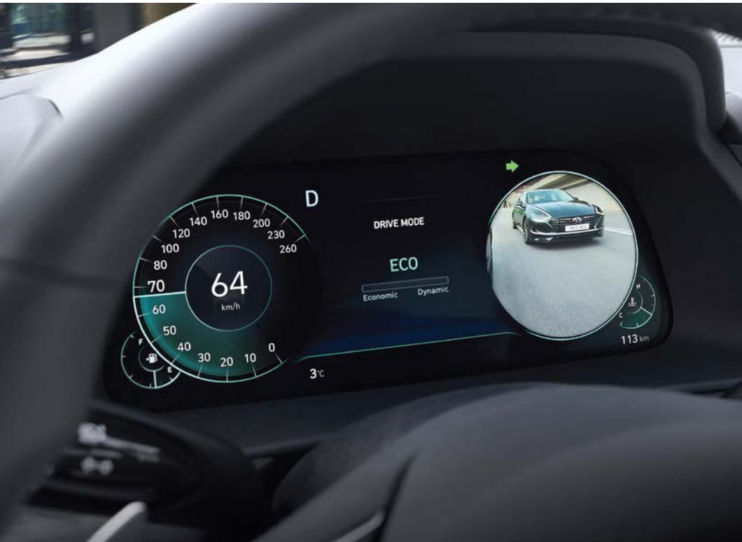
Blind spot view monitoring (BVM)

Sonata's cutting-edge safety features will always have your back. See more with Surround View Monitor, and the Blind Spot View Monitor displays the presence of an unseen vehicle. The BVM's 50-degree field of view far surpasses the coverage of the outside mirror for safer, more confident driving.