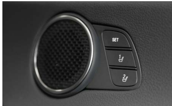
Memory seat with 2 users setting