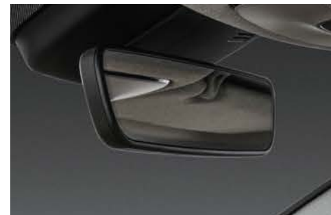
Electronic chromic mirror (ECM)