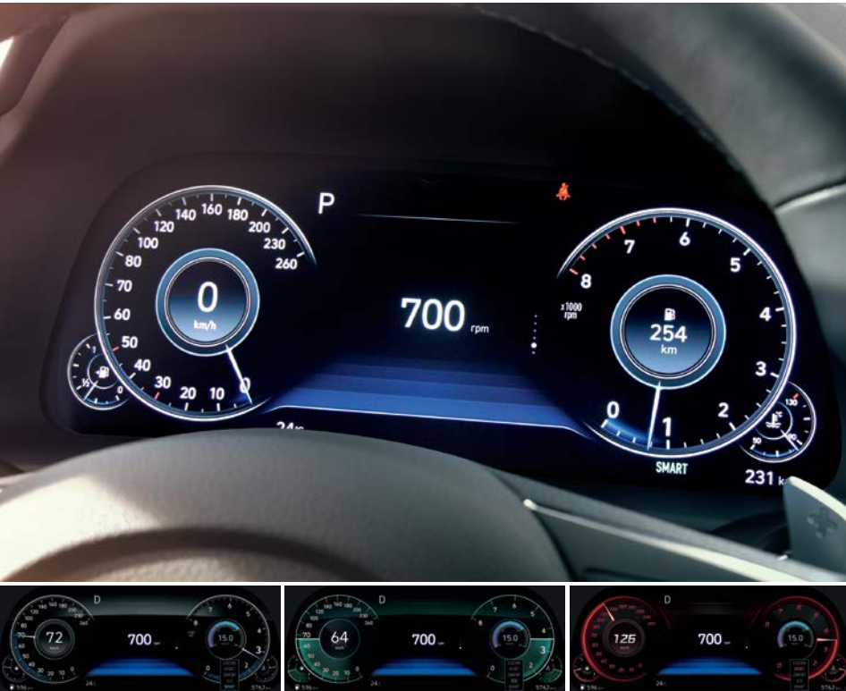
12.3 inch full high resolution LCD cluster / Integrated driving mode (Comfort / Smart / Eco / Sport)

Like an extension of your body, Sonata has a way of becoming a part of you. The seats comfort and cradle you. All gauges, control knobs and pedals align perfectly with eyes, hands and feet for a sense of complete confidence and total control. The 8" audio unit is compact but highly capable with a menu interface that is designed to be simple and intuitive to operate and provides you with quick and effortless access to all key functions while on the move.