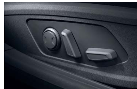
8-way power seats with 2-way lumbar support