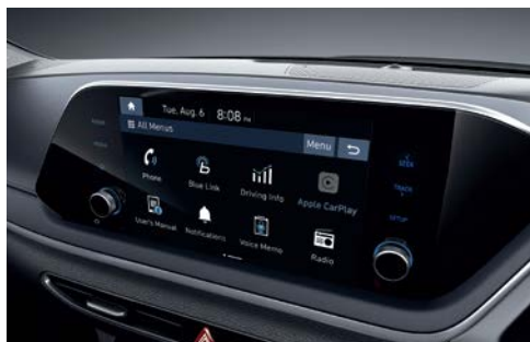
8" LCD touch screen