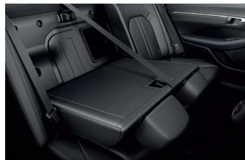
Seat folding system (6:4 type)