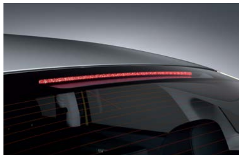
LED high mount stop lamp