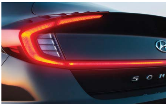
LED rear combination lamps