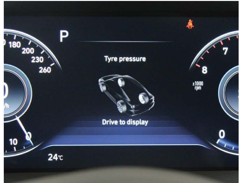
Tyres pressure monitoring system (TPMS)