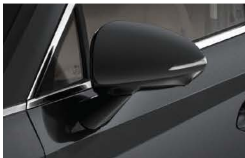
Side mirror with electric control & folding

From the exterior styling to the luxurious interior, Sonata projects sensuous comfort which served as the guiding concept throughout Sonata's development. And because today's drivers want a smart, personalised experience, Sonata answers the call with a suite of connectivity and convenience features. Whatever your lifestyle, Sonata is the perfect fit that will open the door to a whole new world of driving freedom and pleasure.