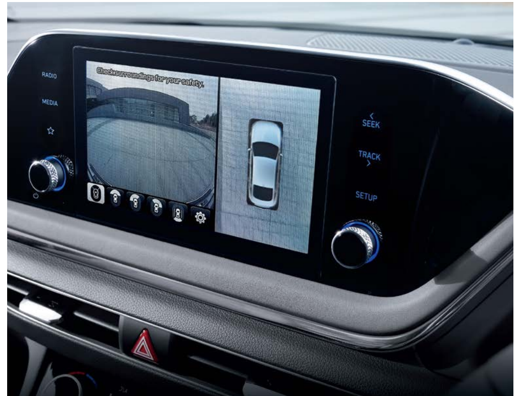
Surround view monitor (SVM)

SVM uses the AV head unit to serve up a 360-degree birds eye view of the car and its surroundings.