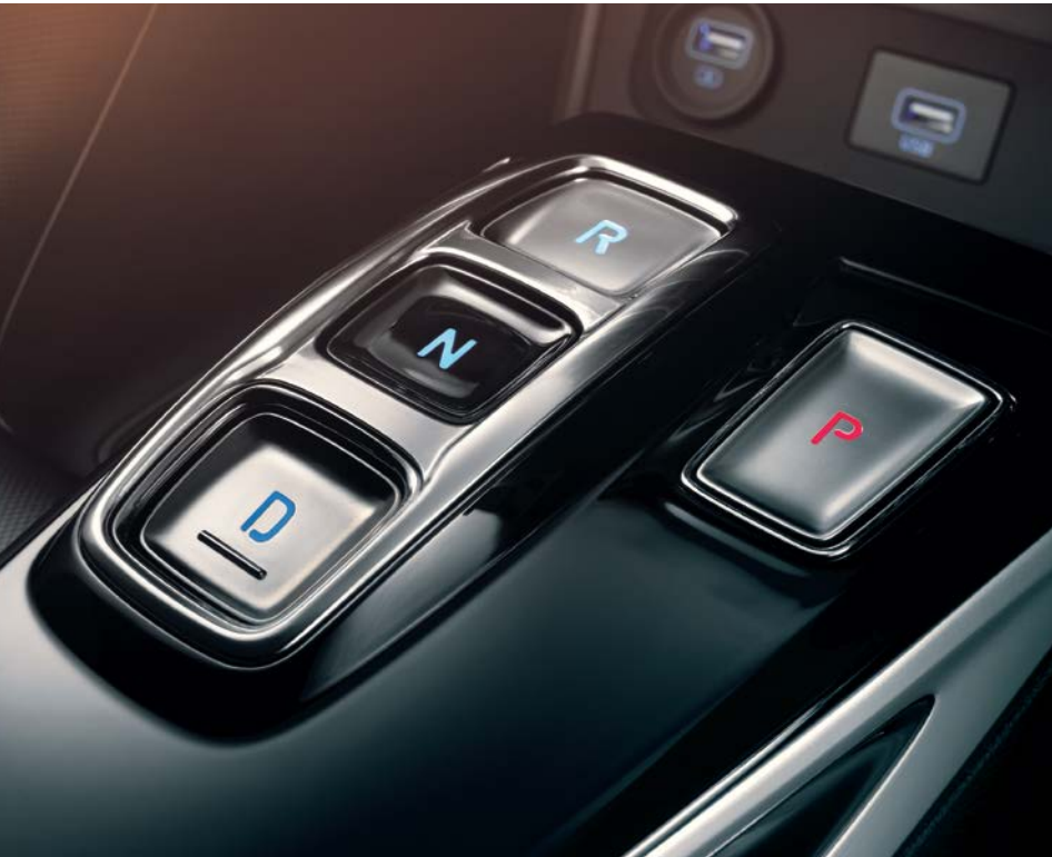
Electronic shift button (Shift-by-wire)

The all-new Hyundai Smartstream is the next generation powertrain that enable better fuel efficiency, improved real-world performance, and reduced emissions. Sonata dials it up with an all-new powertrain mated to a six-speed automatic gearbox. Gear selection is controlled by a new Electronic Shift Button (shift-by-wire) selector that makes for safer, more precise and fool-proof gear changes and its smaller footprint clears up valuable space on the centre console. This same push-button convenience is brought to the electronic parking brake which comes with auto-hold that allows the driver to remove his foot from the brake pedal during stops to relax the leg muscles while maintaining brake pressure.