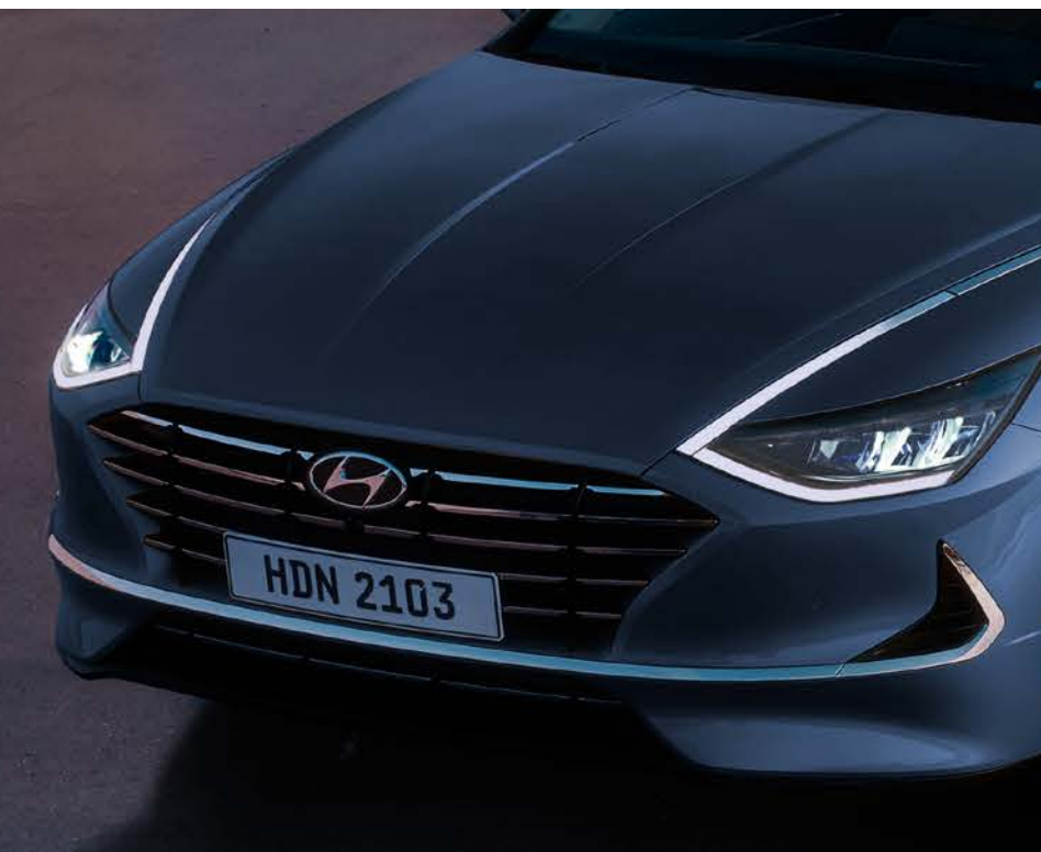
Radiator grille / LED daytime running lights (DRL) / LED headlamps (MFR type)

Sonata's high style does more than just spark the emotions. It delivers high rewards with innovative design features like the gradient hidden light technology, a sure conversation starter that adds to Sonata's mystique. Sonata's high-tech image is reinforced with LED rear combination lamps and available full-LED front lighting.