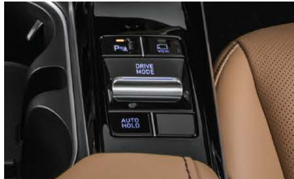
Drive mode selector and auto hold function