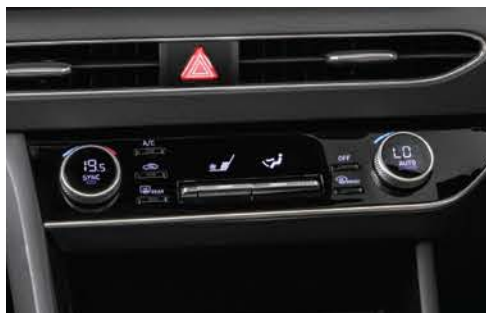
Full auto air conditioning system