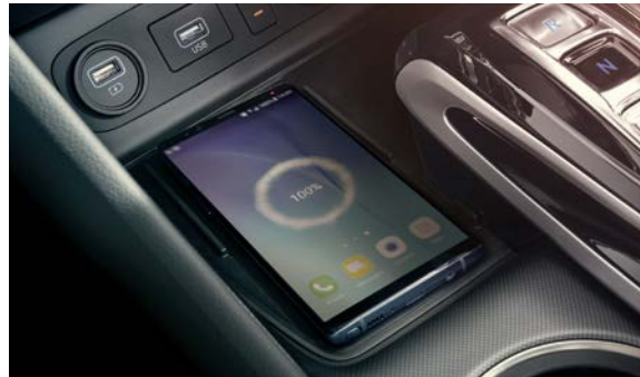
Wireless smartphone charging with temperature sensor and cooling function.